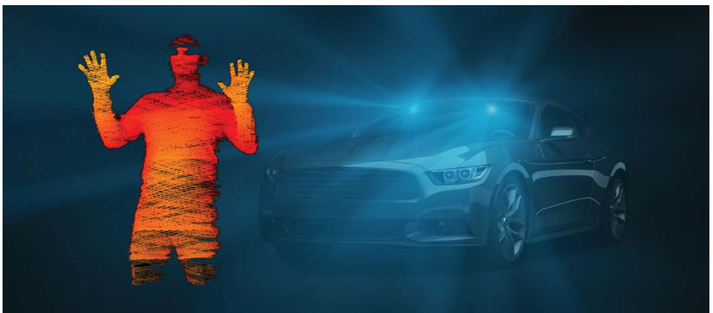
Scanning of a man with VoxelFlow™.